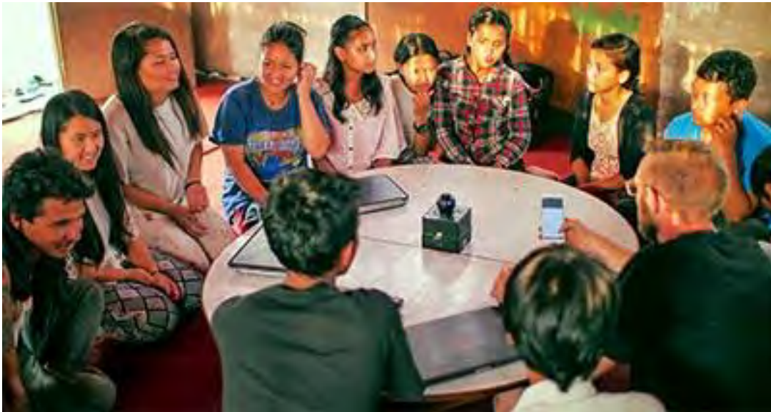
Community cooperative in Kathmandu, Nepal.

Since July of 1923, the annual celebration of the cooperative movement has taken place on the first Saturday of this month. The United Nations together with International Cooperative Alliance, have established themes for the celebration of this special day, to increase awareness and the emphasis that cooperatives are people-centered, not capital-centered and thus community-based. The theme for this year is “ Cooperatives Build a Better World ”.